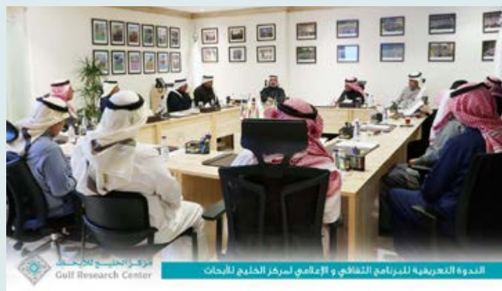
GRC Cultural and Media Program Symposium, Riyadh