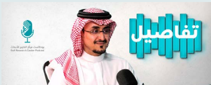
GRC Podcast Episode 1 & 2 Series: KSA Founding Day, Day of Pride